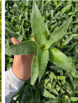
2" Agave Blue Flame Special $1.85, 60/tray